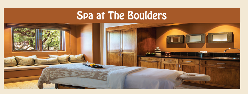
Restore mind and body at our 33,000 sq. ft. spa, offering stimulating revitalization through the art of massage, the science of facials, and other refreshing therapies infused with ingredients from the Boulders' desert environment.

Fitness Center open daily from 7am to 5pm Spa Pool access included with Service Services available Wed - Sun from 10am to 3pm