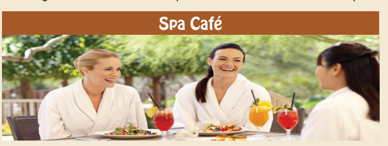
The fresh, healthy and balanced snacks at the Spa Café are made from regional ingredients and fresh herbs harvested daily from our own Organic Garden.